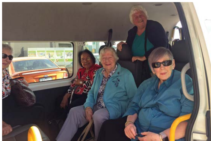
Below: Residents enjoying an outing to Geelong in one of the first trips for the new bus.