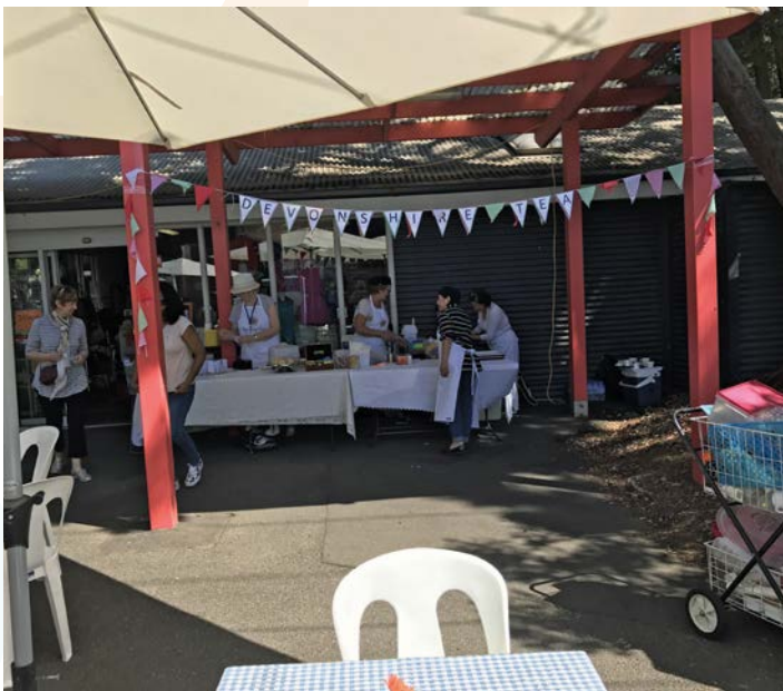
Activity at the Devonshire Tea stand.

Thank you to all the staff and volunteers involved in the planning, bump-in and bump-out on the day.